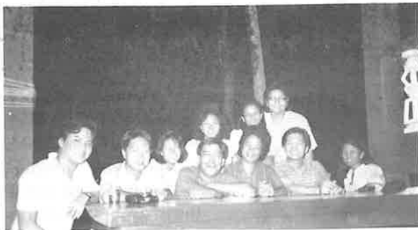
Members of AMDA Philippines