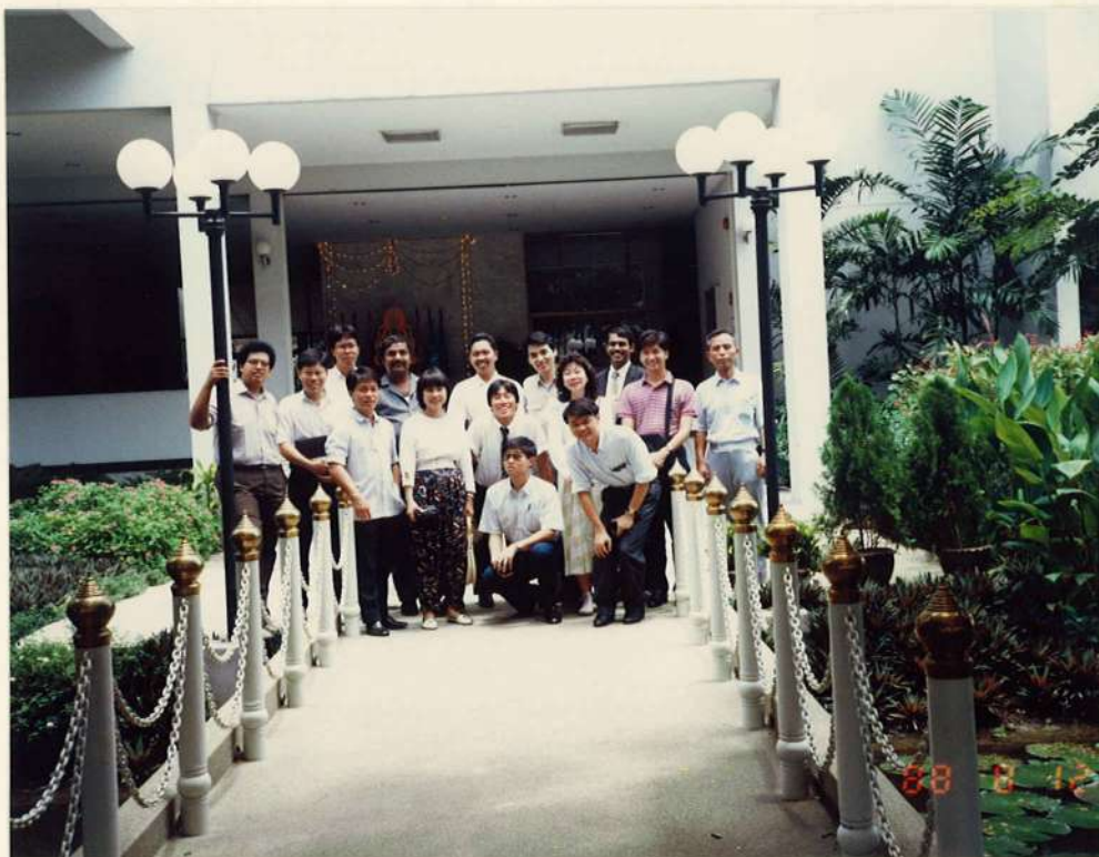
Participants of AMDA Meeting from five member countries

The executive committee meeting and the 5th conference of AMDA was held in Thailand with the participation of five member countries viz. India, Japan, Malaysia, Philippines and Thailand.