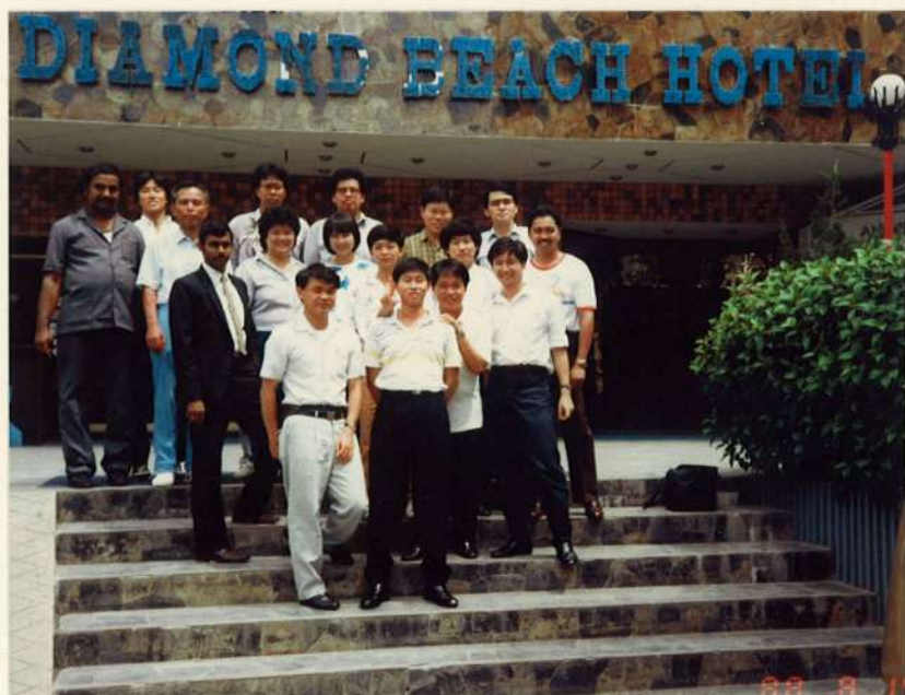
Participants of AMDA summer meeting in Thailand