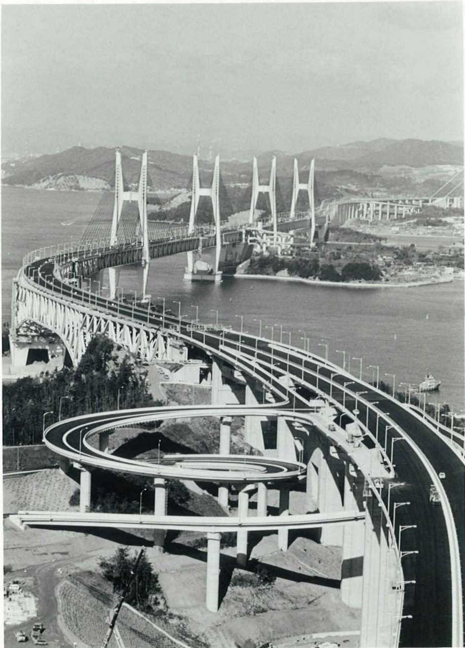
Photo of a portion of Seto - Ohashi viewed from Hitsuishi-Jima area

□□ Welcome to Okayama !! Seto - Ohashi, the prestigious project of Japanese technology which will be inaugurated on April 10, is attracting visitors from within Japan and outside Japan. This bridge connects Honshu and Shikoku, the two main Islands of Japan. To commemorate this, Expo '88 Okayama is being held from March 20th to 31st August. It is a compound bridge 12306 meters long built above the inland sea and earth which has 6 main bridges of which 3 are suspension bridges, 2 are cable stayed bridges and 1 is truss bridge, all are double deck bridges. On the strait section from Mt. Washu to Ban-nosu area the bridge is 13.1 km. long.