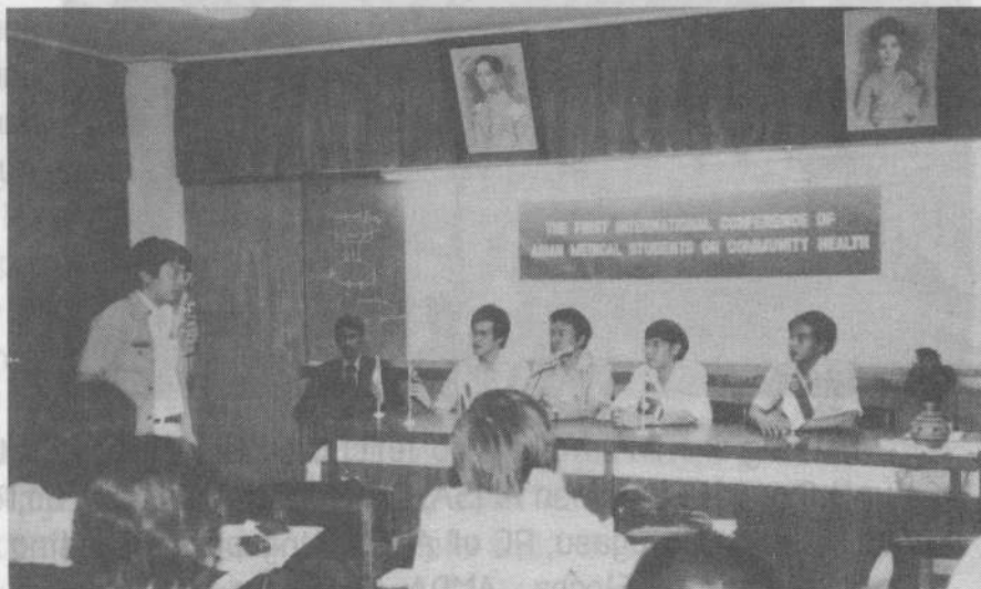
Photo of First AMSA Conference held in Bangkok, Thailand, in August 1980 on "Community Health".