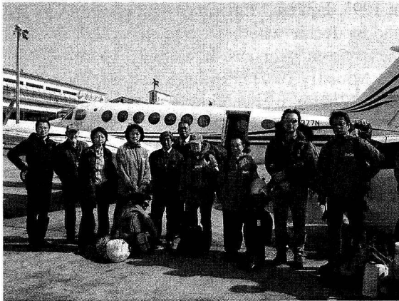
An AMDA medical team on their way from Okayama Airport to Hanamaki Airport in Iwate Prefecture via charter plane