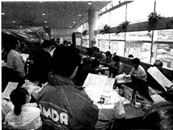
Regular meeting for medical staff at the Kamaishi City Disaster Headquarters, led by the Kamaishi City Medical Association