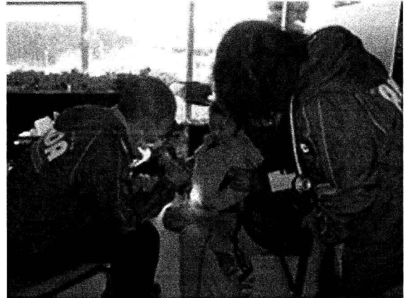
AMDA physicians and nurses providing medical services at an evacuation center